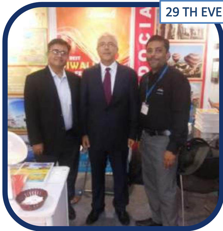
29 TH EVENT