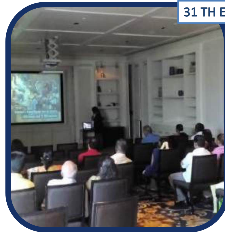
31 TH EVENT