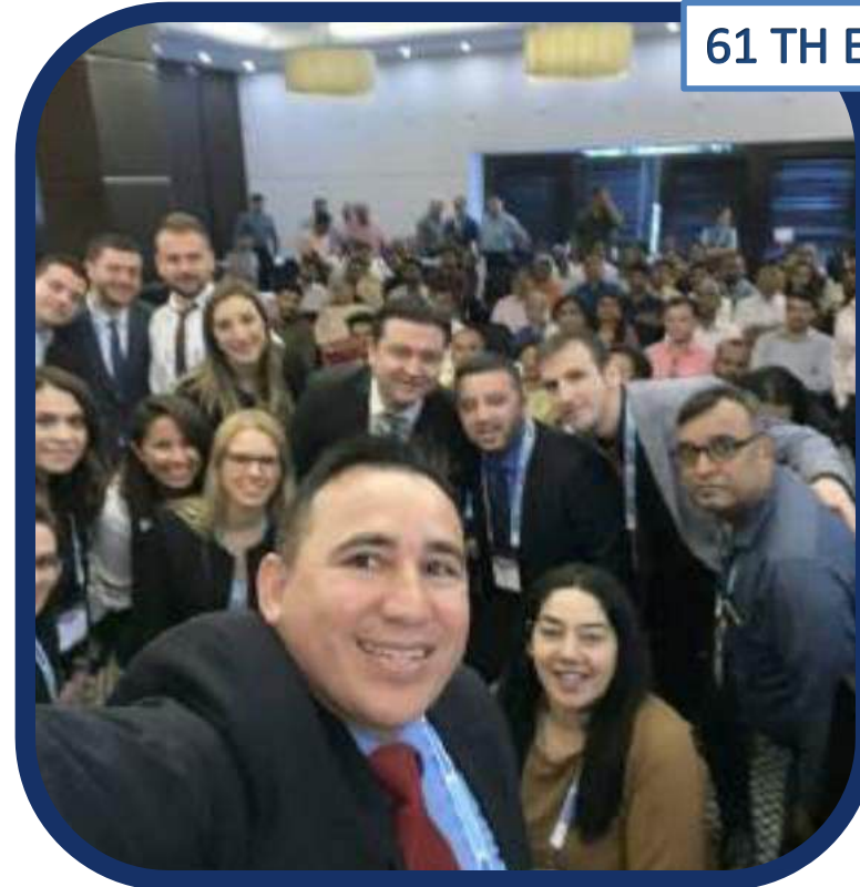
DESTINATION "TURKEY" WORKSHOPS IN BANGALORE, INDIA