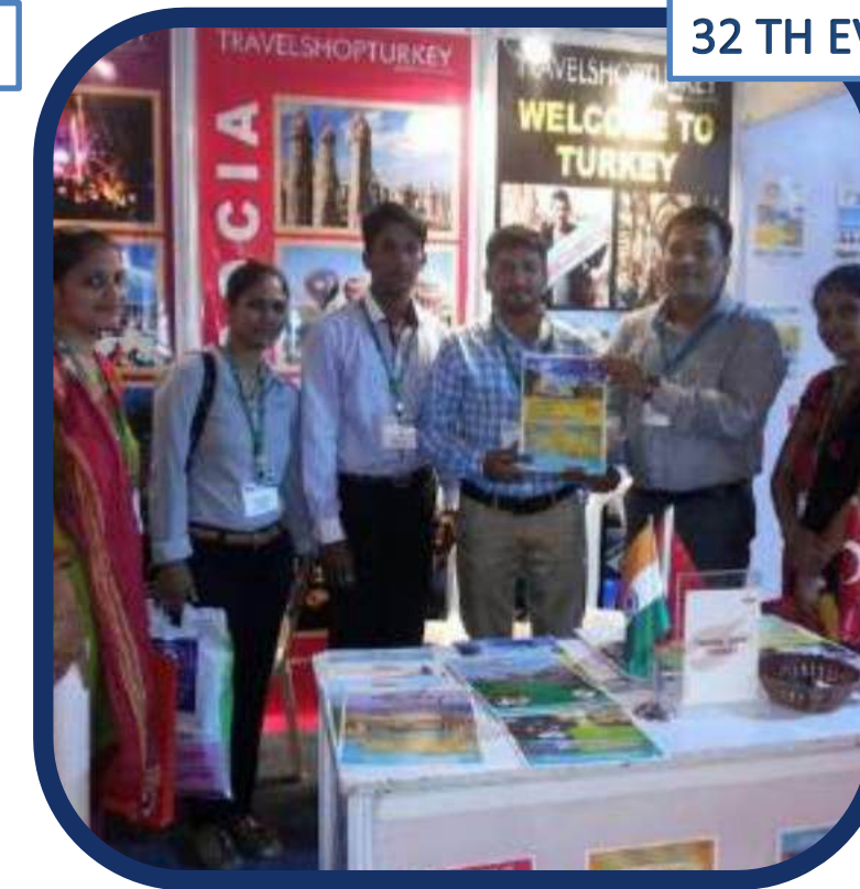
32 TH EVENT