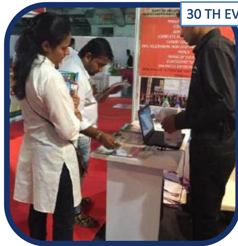
30 TH EVENT