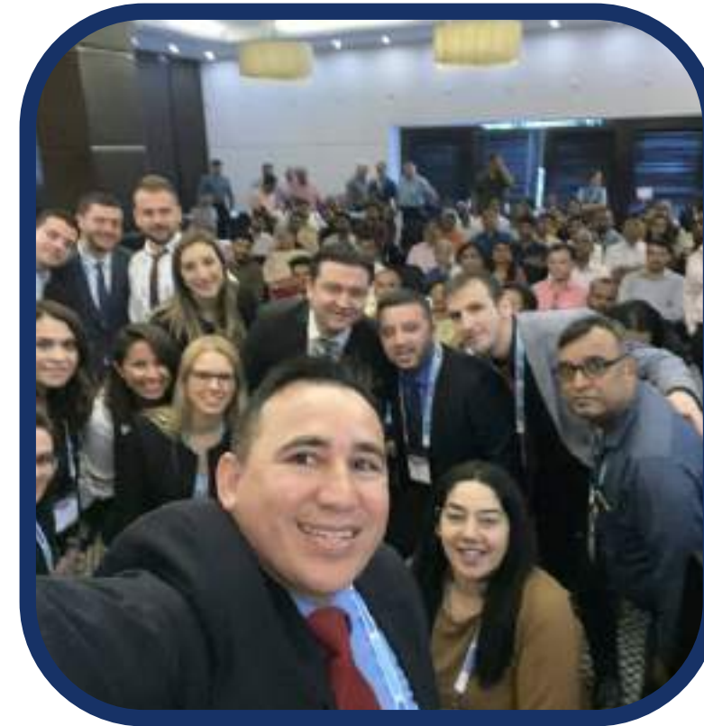
DESTINATION "TURKEY" WORKSHOPS IN BANGALORE, INDIA