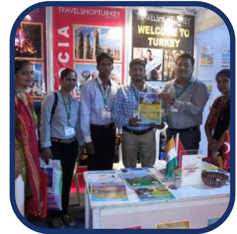
DESTINATION "TURKEY" WORKSHOPS IN PUNE, INDIA