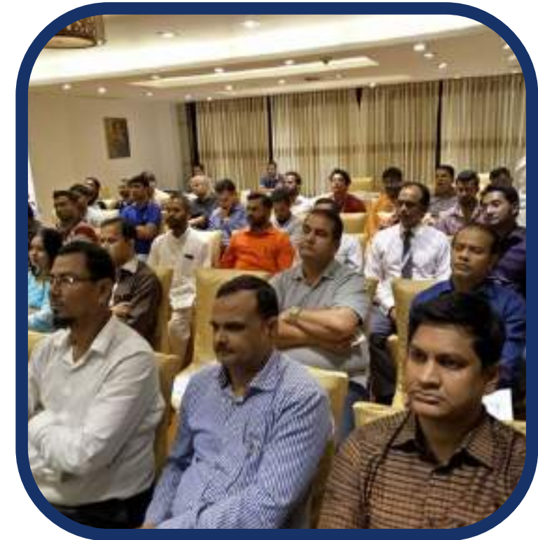
DESTINATION TÜRKİYE WORKSHOPS IN DAKKA INDIA