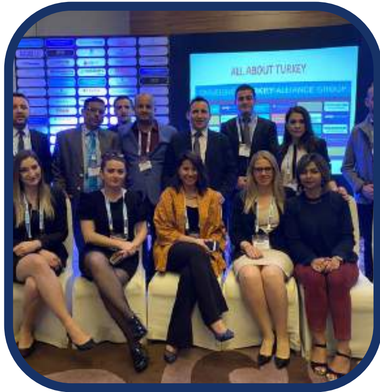
DESTINATION "TURKEY" WORKSHOPS IN KOLKATA , INDIA