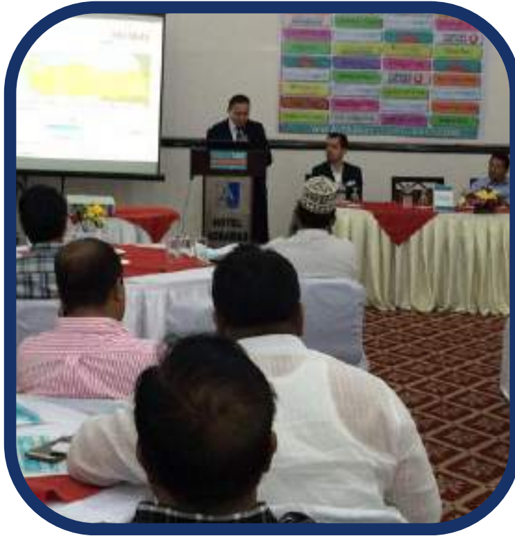
DESTINATION TURKIYE WORKSHOP IN CHITTAGONG BANGLADESH