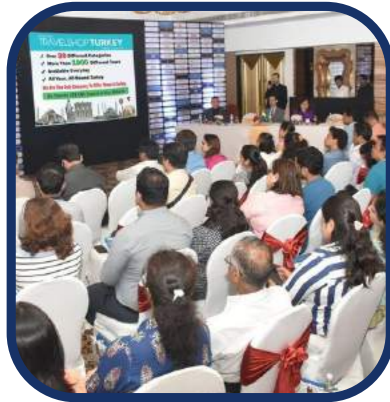
DESTINATION "TURKEY" WORKSHOPS IN AHMEDABAD INDIA