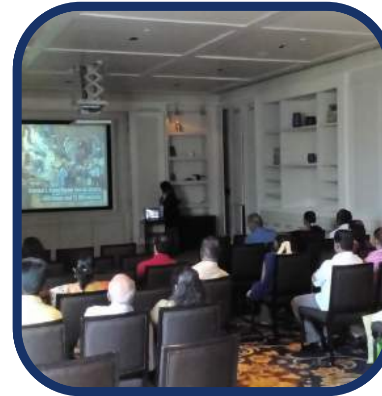
DESTINATION "TURKEY" WORKSHOPS IN BANGALORE, INDIA