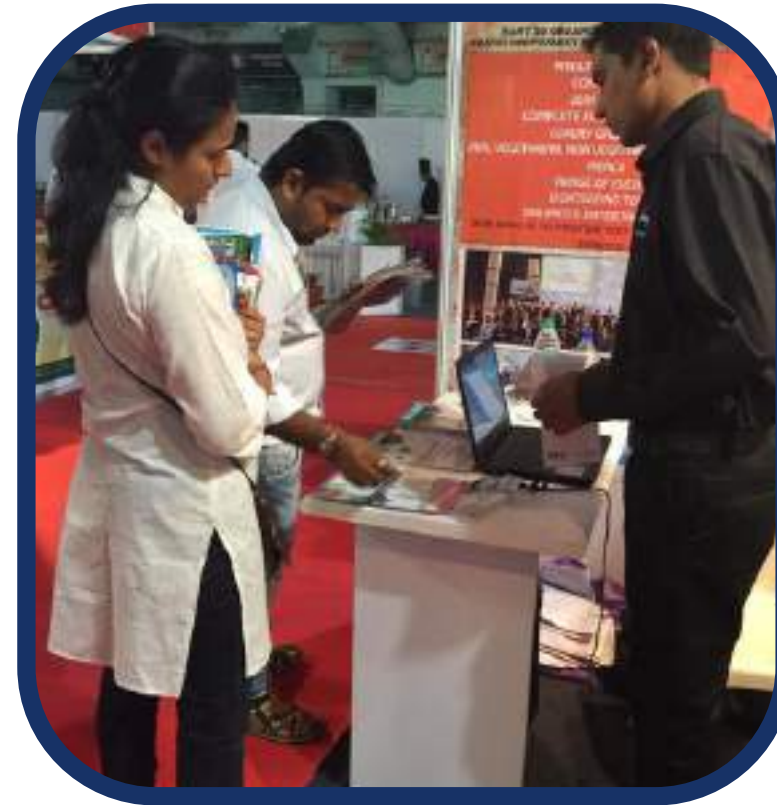
DESTINATION "TURKEY" WORKSHOPS IN SURAT, INDIA