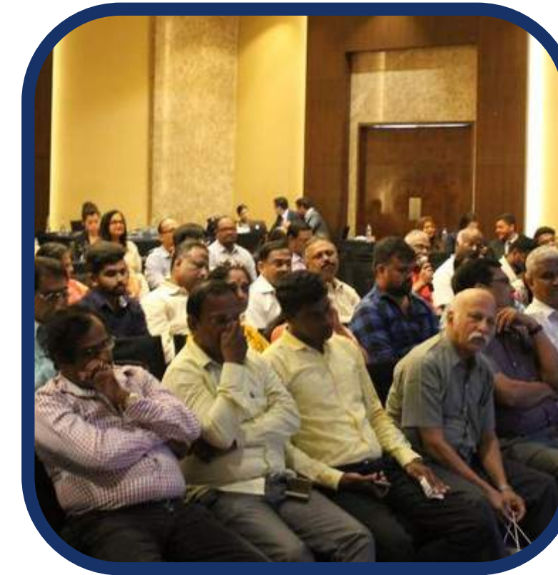
DESTINATION "TURKEY" WORKSHOPS IN CHENNAI, INDIA