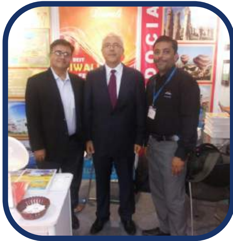
DESTINATION "TURKEY" WORKSHOPS IN MUMBAI , INDIA