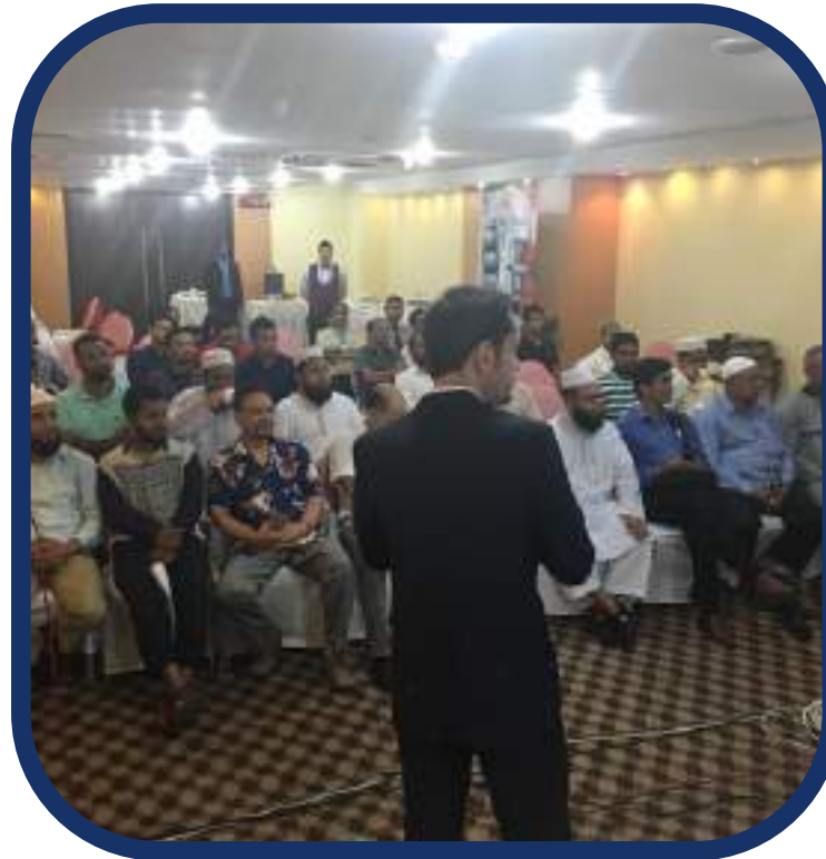
DESTINATION TÜRKİYE WORKSHOP IN SYLHET BANGLADESH